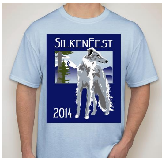
Short sleeve T-Shirts are offered in ash Grey and Light Blue