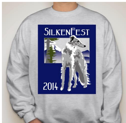
Long Sleeve T-Shirts and Sweatshirts both come in ash grey