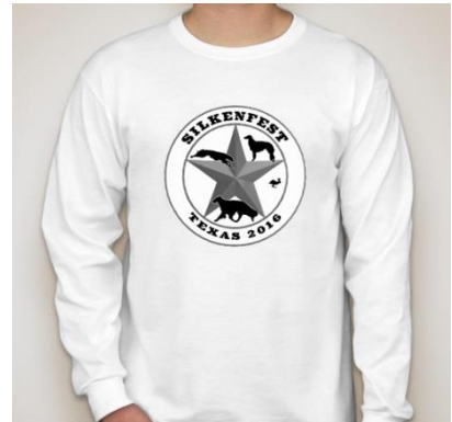
Long sleeve T-shirts offered in Dark Heather, Light Blue, and White ($22.00)