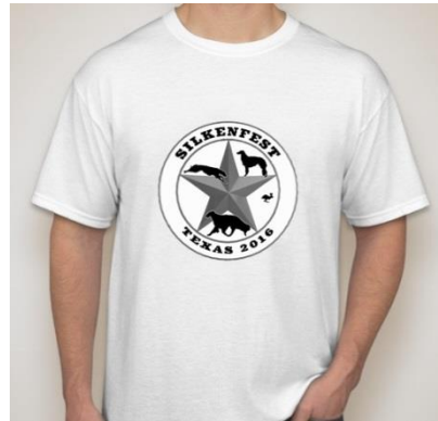
Short sleeve T-shirts offered in Orchid, White, and Dark Heather ($18.00)