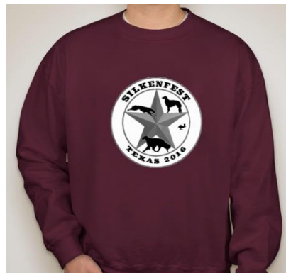
V-Neck T-shirts offered in tri-blend Purple ($22.00), Sweatshirts in Maroon and white ($28.00)

All apparel will be available in S to XXL