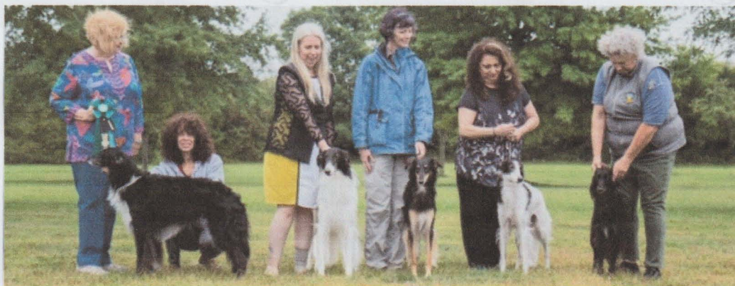
Cool Run Andrew Wyeth, Solo's The Reaping (Cinna), 24K JDF Tax Deferred WindNSatin (Ira)