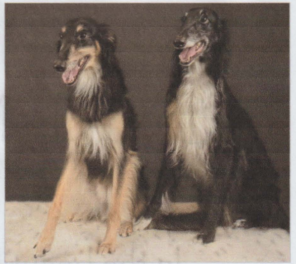
IRA & Wyeth